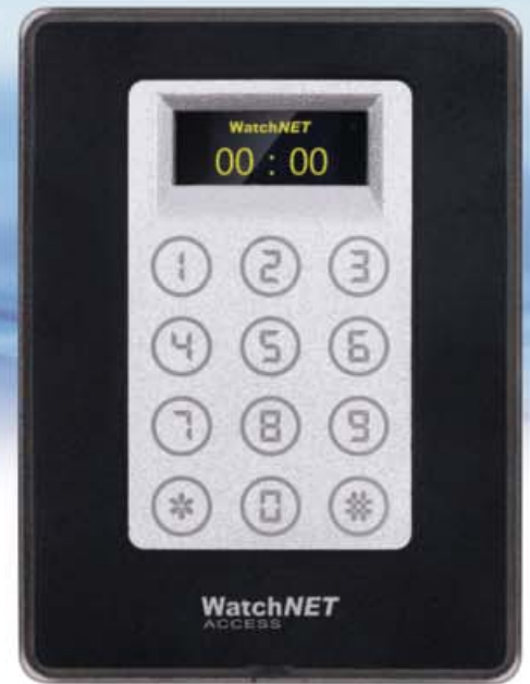
WAC-1D2T-MICRO (Built-in EM/HID Proximity Reader)