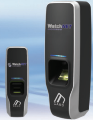
WAB-P-FCRS / WAB-U-FCRS Biometric Finger Print Reader (Narrow) P: Proximity; U: CPU & Mifare Sector